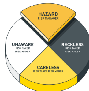
The Circle of Choice

“After 30 years in oil and gas, this is the first safety workshop that has made me stop and think differently about safety; I’m so grateful.”